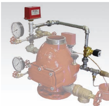
QRS Electronic Accelerator