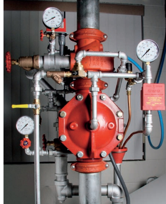
DV-5 Pre-Action Valve

Use guidelines per NFPA13-2007 7.9 System Requirements for Refrigerated Spaces