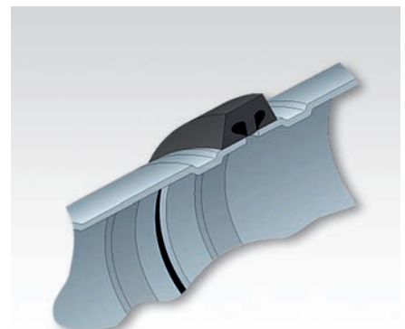
Tri-Sealed Grooved Gasket