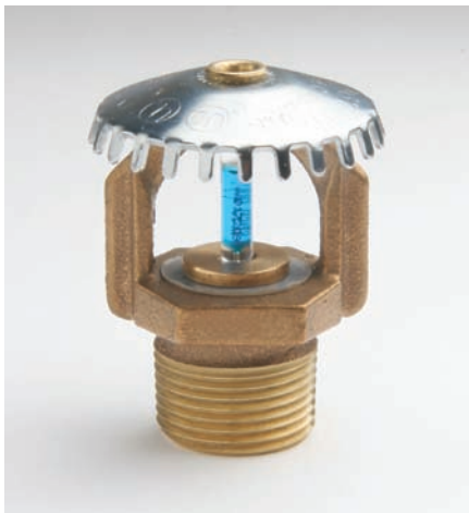
Ultra K 17 141°C Sprinkler