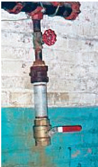
Example of a field generated drum drip with multiple fittings and pipe nipples. NOTE: the example shows seven make-ups.