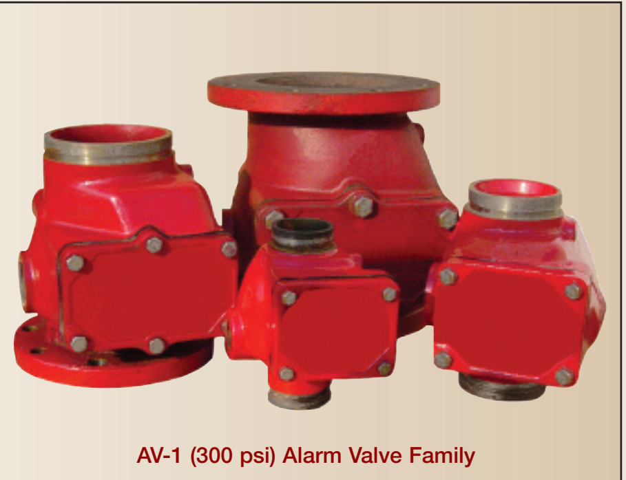
AV-1 (300 psi) Alarm Valve Family

Model AV-1 Alarm Check Valve, 300 psi (20,7 bar) 2-1/2, 4, 6, & 8 Inch (TFP910)