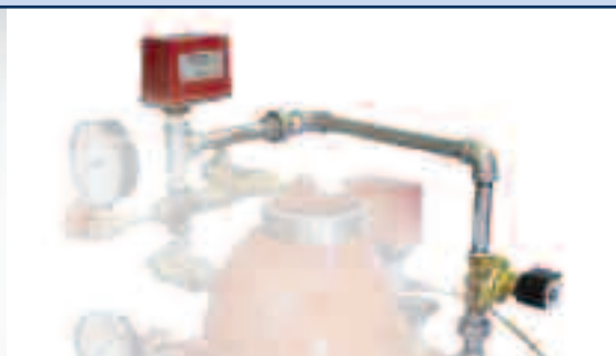
QRS Electronic Accelerator