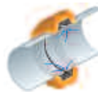
Tri-Sealed Grooved Gasket

The patent-pending Quell™ Fire Sprinkler System is the first of its kind for cold storage, outdoor and unheated warehouse facilities . In terms of performance, the Quell™ Fire Sprinkler System effectively addresses a fire with a volume of water with a “surround and drown” configuration to rapidly reduce the heat release rate. This fire protection approach minimizes damage to storage facilities and valuable goods.