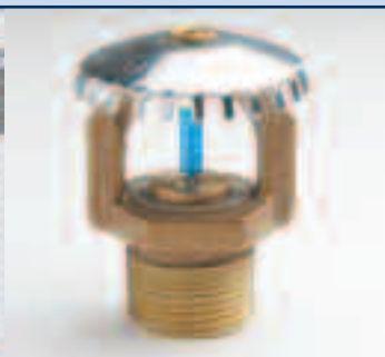
Ultra K 17 286°F Sprinkler