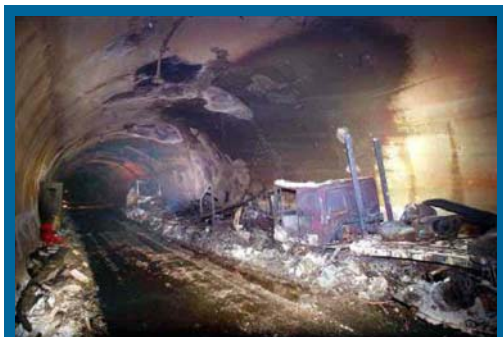
Aftermath & Damage of European Tunnel Fires

The discussions and subsequent legislation came as a result of a series of fires in tunnels in Europe with multiple loss of life. The fires resulted in such intense heat release, that fire departments found it impossible to enter the tunnels with manual equipment. The most devastating loss occurred in the Kaprun Ski Resort tunnel fire over three years ago in Austria, where a fire in a heater on a mountain train spread through the train, killing all of the 155 people that were on board. Other disastrous tunnel fires have included the Tauern and St. Gotthart road tunnels in Germany. Investigations in these and other tunnel fires showed that the loss of life did not occur as a result of being directly involved in the cause of the fire, but in an attempt to escape the tunnel.